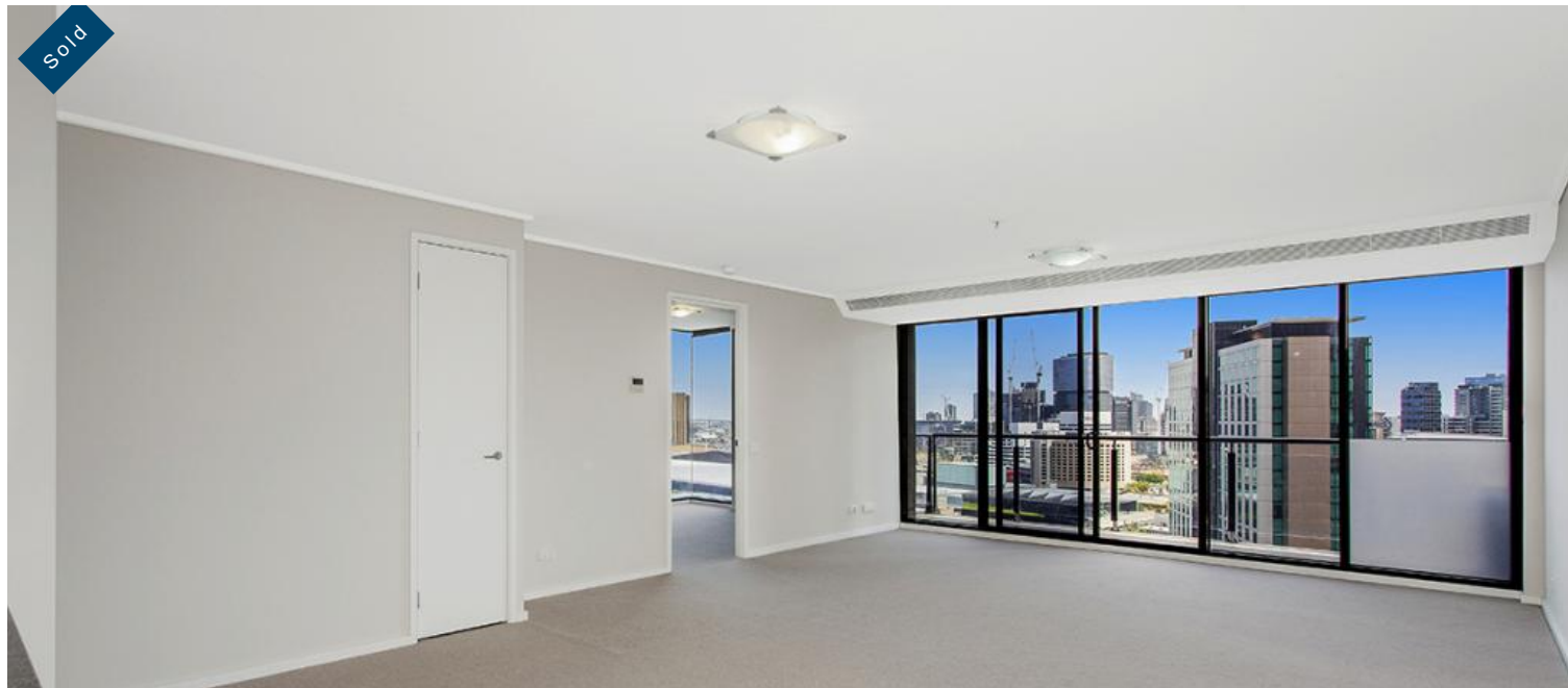
Unit 200/183 City Rd, Southbank