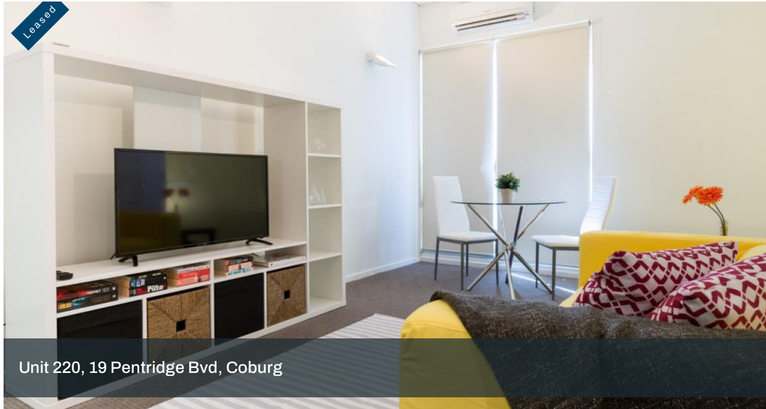
Unit 220, 19 Pentridge Bvd, Coburg