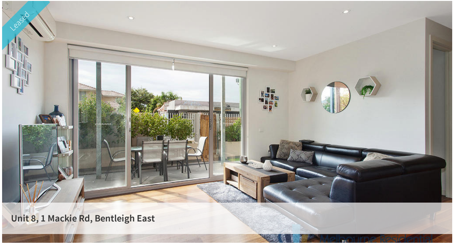
Unit 8, 1 Mackie Rd, Bentleigh East