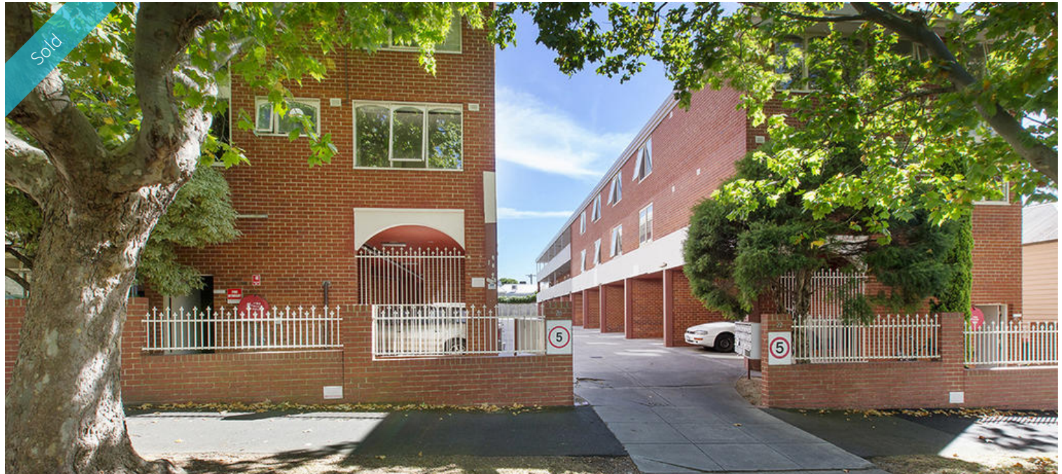
Unit 34, 22-28 Canterbury St, Flemington