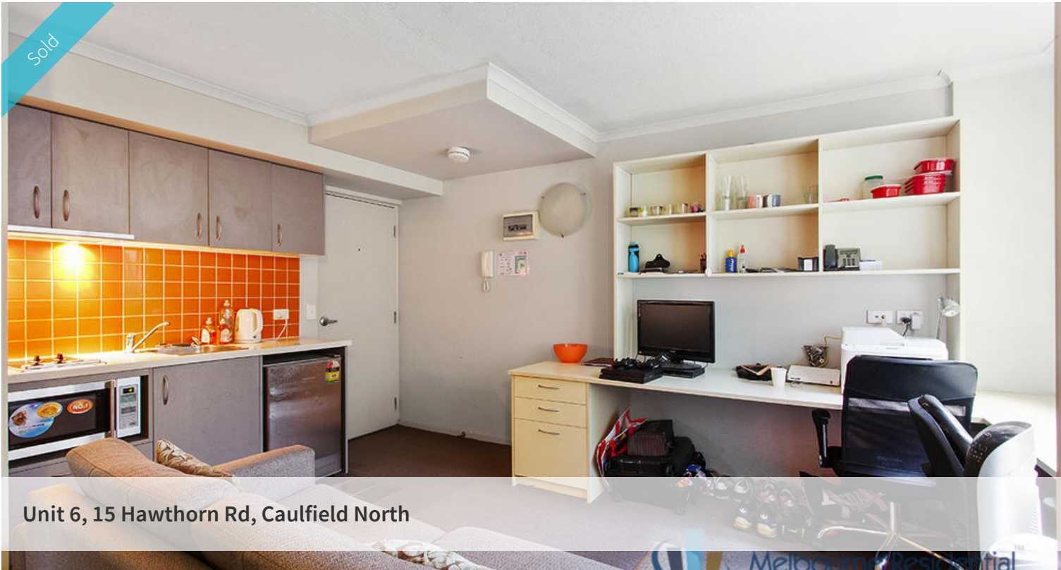
Unit 6, 15 Hawthorn Rd, Caulfield North